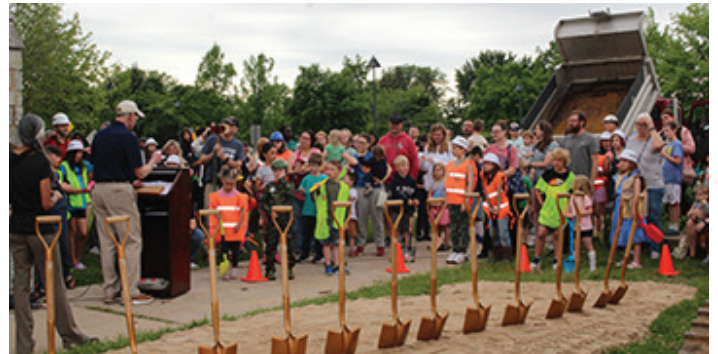
Kids Groundbreaking Crowd