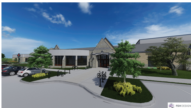
Architect's rendering of library exterior with new atrium

The ability for an organization to accept and embrace change illustrates its resiliency. It is also an indicator for future success. The Friends of the Sun Prairie Library is saying goodbye to several long-term Board Members, as their terms are coming to an end. We will still see most of these valued Friends at the library continuing their volunteer activities as they will remain a part of the Friends organization. We hope these dedicated individuals understand how very grateful we are for their past, present and future service.