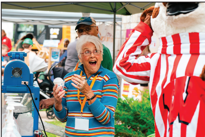
Friends volunteers scooping sno-cones. You never know who you'll meet while volunteering!